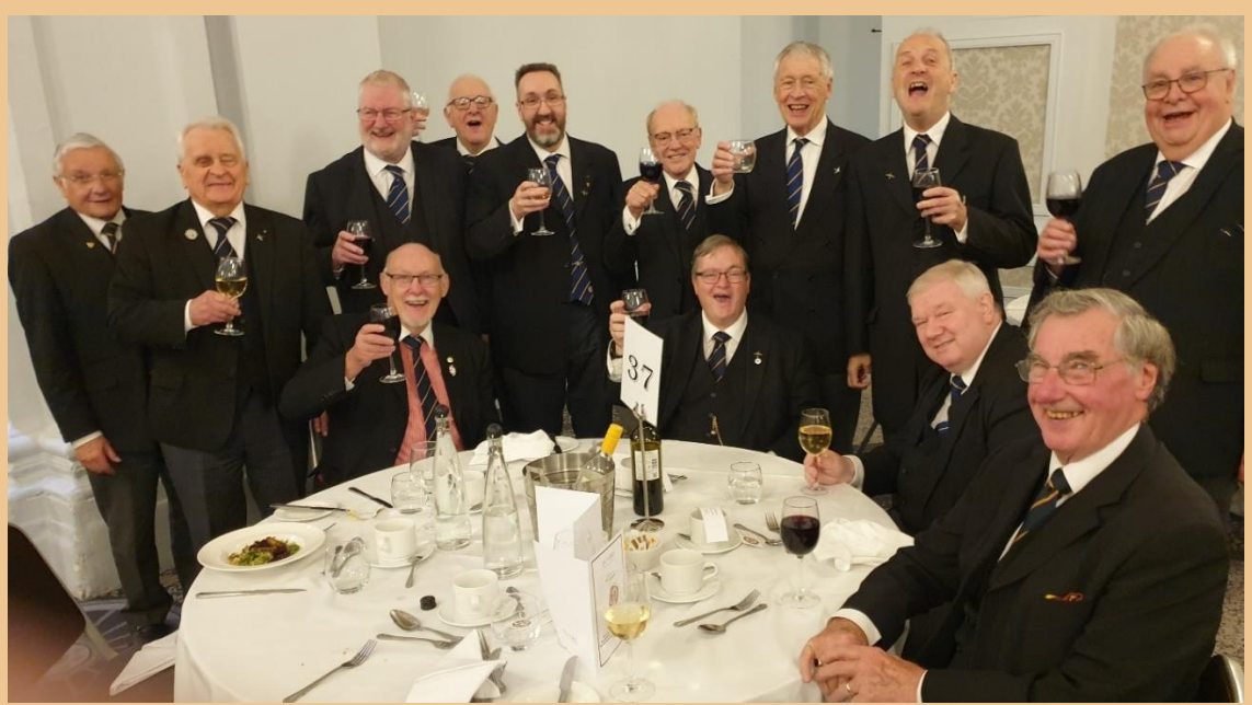
Worcestershire and Warwickshire at the festive board

Mark Masons' Hall have shared photographs of the event <a href="here">here</a> and a movie <a href="here">here</a>.