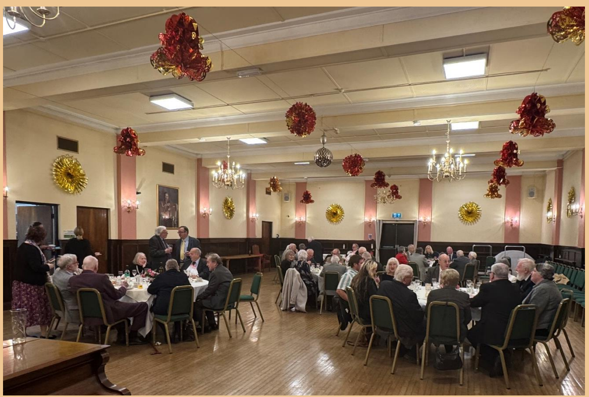
A great mix of Worcestershire and Warwickshire to each table