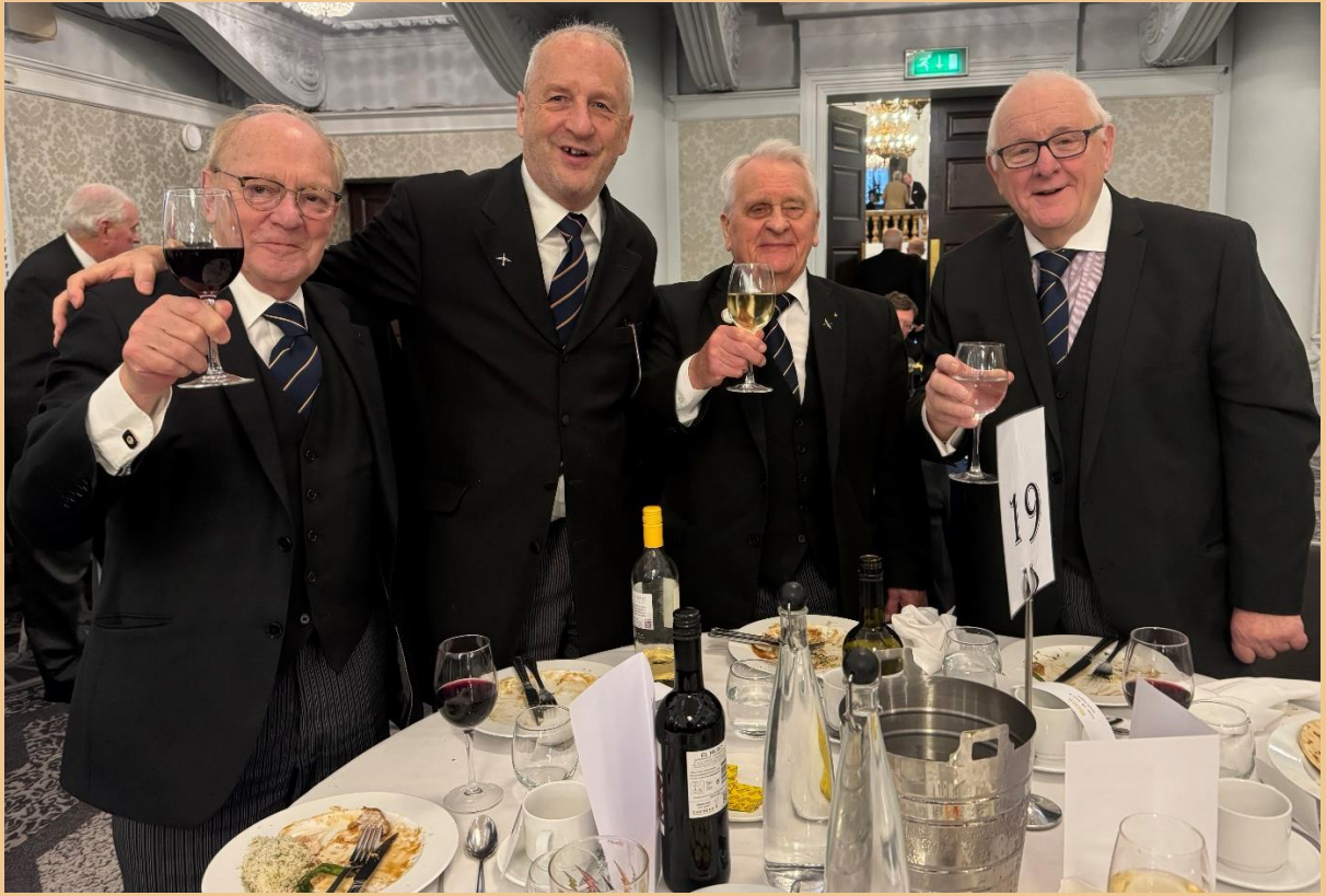
Worcestershire brethren after receiving their promotions

This took place at Freemasons' Hall on Thursday the 14<sup>th</sup> of November. Great day in which four of our brethren received grand honours. We also able to enjoy friendship with our Warwickshire brethren at the festive board.