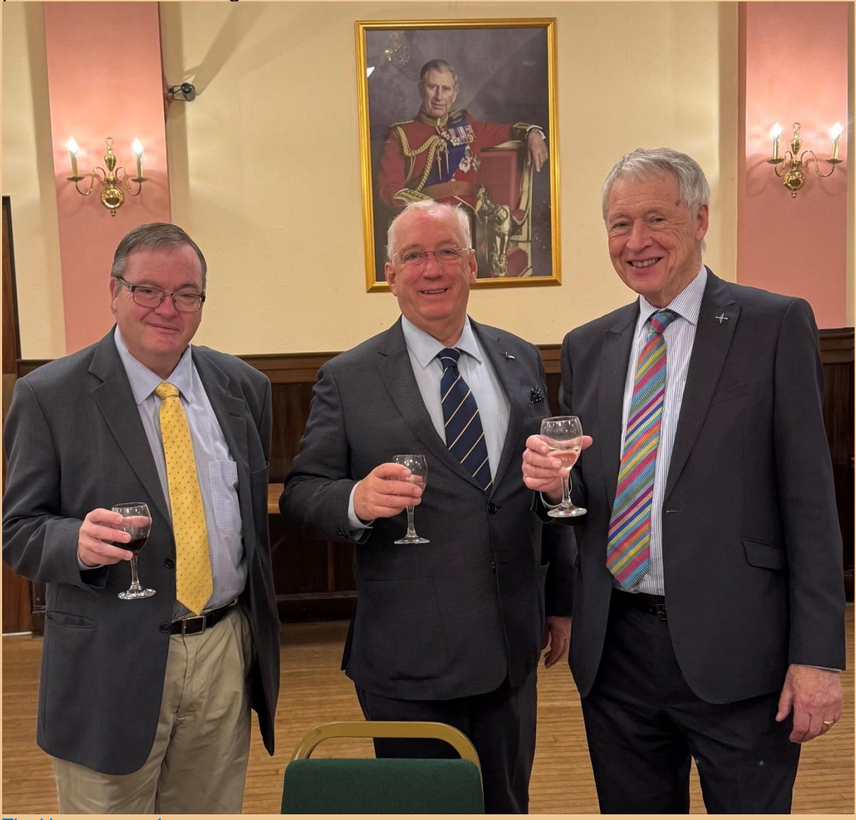
The king approves!