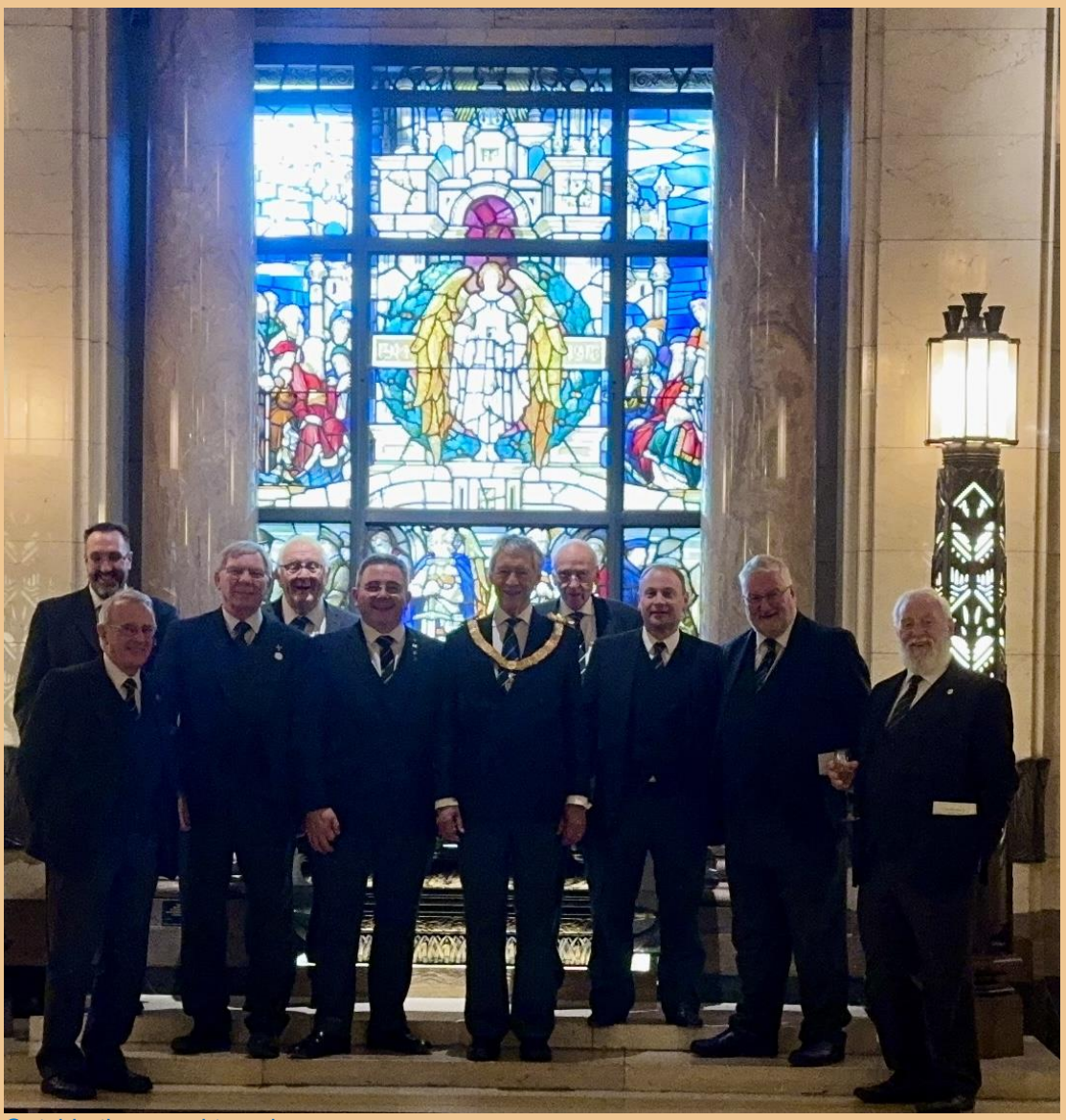
Outside the grand temple