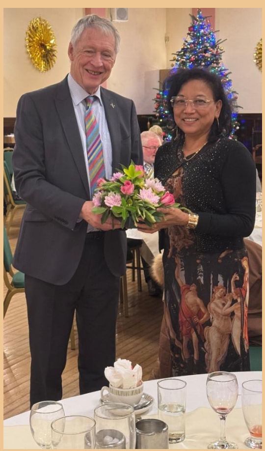
Flowers for the ladies