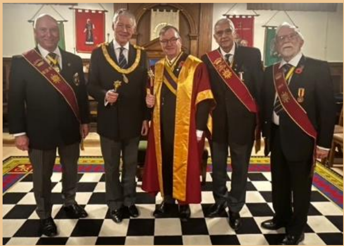
With thanks to V.W.Bro Gareth Hughes whose photograph and text I stole from Facebook.